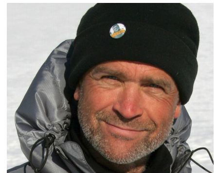
Lieutenant Colonel Henry Worsley MBE (4 Oct 1960 – 24 Jan 2016)

A hundred years ago this Easter weekend, 20 months after leaving London, Sir Ernest Shackleton, Frank Worsley and four crew, set off in one of the 22 foot lifeboats, the James Caird, rescued when the Endurance was crushed in the Antarctic ice, to sail the 800 miles to South Georgia to get help. With just a compass to guide them they arrived on South Georgia, having survived 40 foot waves and atrocious weather, 16 days later on 10 May. After three false starts, Shackleton safely rescued all his men on 30 August 1916.